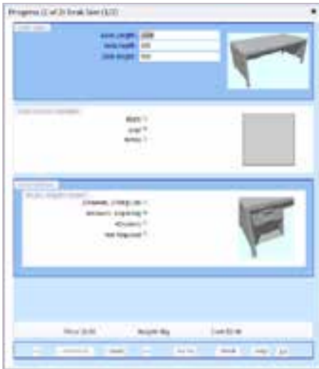
Step through each screen to build unique customer solutions