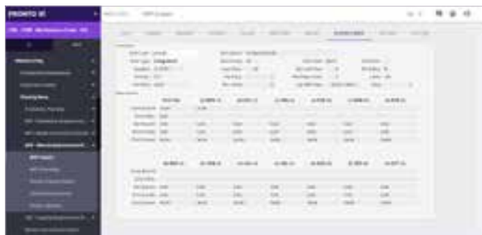
Forecast material requirements and plan work orders with ease

Once verified, planned work orders are automatically converted to a work order or purchase order in bulk, grouped by product or other operational requirements. MRP exception messages are generated by the system, while factory loading capacity and materials information can be displayed graphically via Manufacturing Scheduler.