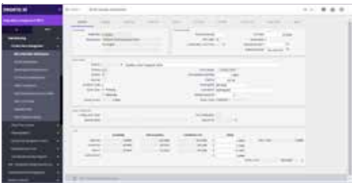
See all information related to the bill of materials, including descriptions, costing, versions, planning details, routing details and more

Item control includes lot, batch and serial tracking data. Extra detail records store other crucial information such as export details, chemical or HazChem classification and production drawings (references)