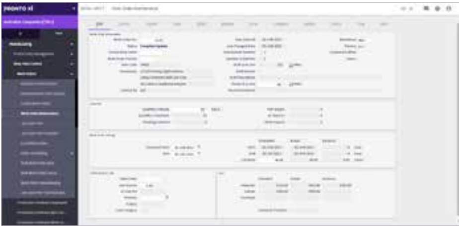
Review the progress of work orders, compare with the dates and details of the bill of materials.